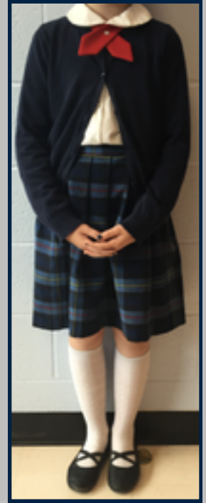
Girl's uniform w/ sweater