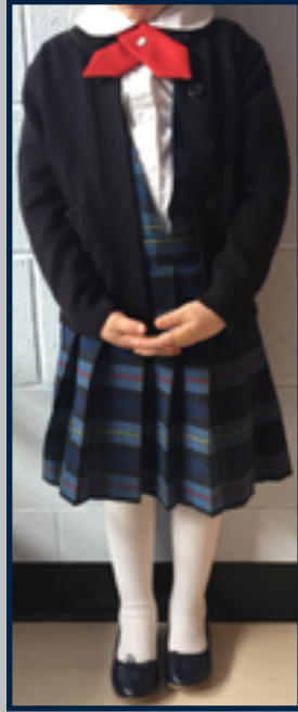
Girl's uniform w/ sweater